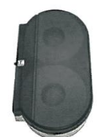
Twin Roll Tissue