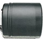
Center Pull Towel

Never run out again. Let us be your one stop shop for your towel and tissue needs. Our paper products meet or exceed current EPA Recommended Recovered (recycled) and are manufactured in the USA.