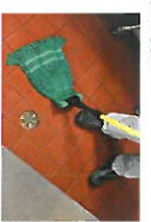
Anti-Microbial Wet Mops