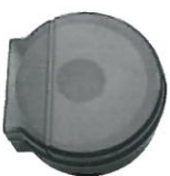
Single Jumbo Tissue