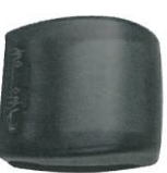
Hard Wound Towel